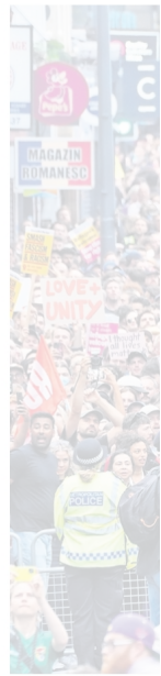
Crowds gathered in I

should serve as a provoke violent disorder or online, you will face the law," he tweeted.